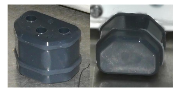
PN 10736 Rubber plug to block unused AC power recepticle.

Power supplies are subject to substitution without notice due to availability issues and changes in regulations.