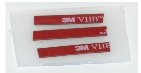
Tape to secure wires.