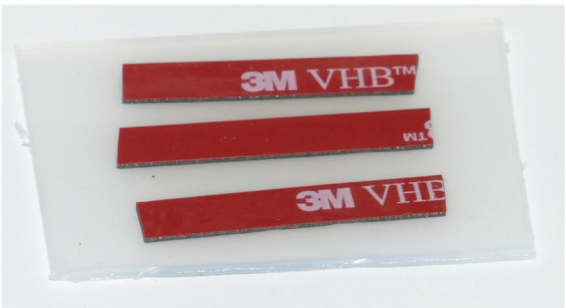
Tape to secure wires.