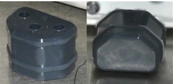
PN 10736 Rubber plug to block unused AC power recepticle.

Power supplies are subject to substitution without notice due to availability issues and changes in regulations.