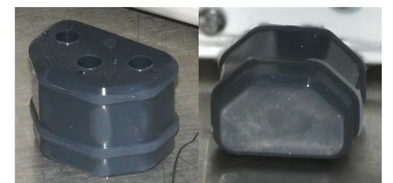
PN 10736 Rubber plug to block unused AC power recepticle.

Power supplies are subject to substitution without notice due to availability issues and changes in regulations.