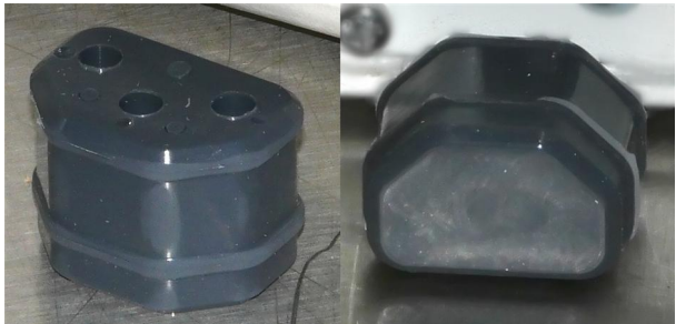
PN 10736 Rubber plug to block unused AC power recepticle.

The illuminator may be powered by plugging the cable into the power supply provided, or into a suitable USB port on a computer or other device.