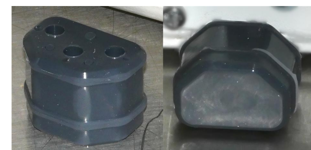
PN 10736 Rubber plug to block unused AC power receptacle.