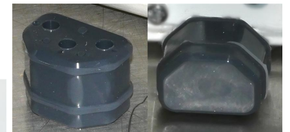
PN 10736 Rubber plug to block unused AC power receptacle.