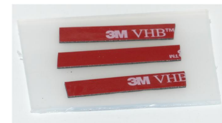
Tape to secure wires.