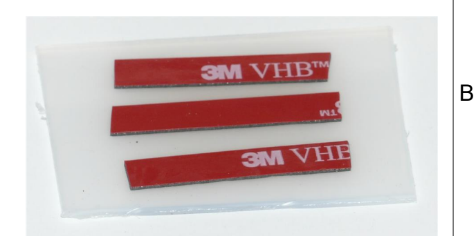
3M VHB tape to secure pot cable

The illuminator may be powered by plugging the cable into the power supply provided, or into a suitable USB port on a computer or other device.