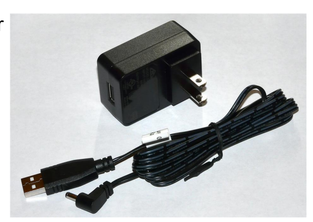
PN 11163 Power Supply 5V 2.1A and PN 10734 Power Cable 1.35mm ID 3.5mm OD x USB A 6 ft.

The illuminator may be powered by plugging the cable into the power supply provided, or into a suitable USB port on a computer or other device.