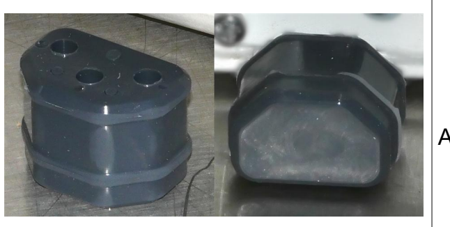
PN 10736 Rubber plug to block unused AC power receptacle.