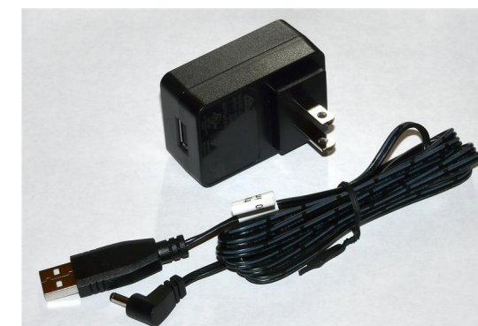
PN 11163 Power Supply 5V 2.1A and PN 10734 Power Cable 1.35mm ID/3.5mm OD x USB A 6 ft.

The illuminator may be powered by plugging the cable into the power supply provided, or into a suitable USB port on a computer or other device.