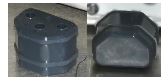
PN 10736 Rubber plug to block unused AC power receptacle.