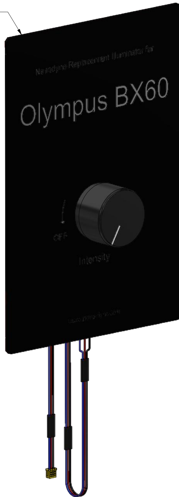
PN 11732 Olympus BX60 Pot Plate Cable Assembly (15 in cable)