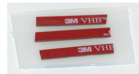
Tape to secure pot cable