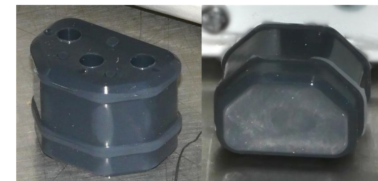
PN 10736 Rubber plug to block unused AC power receptacle.