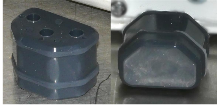
PN 10736 Rubber plug to block unused AC power receptacle.