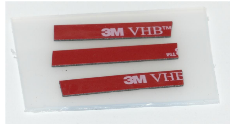
Tape to secure wires.