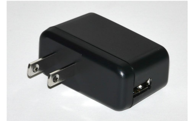
PN 10733 Power Supply - XP Power 5V 1A Fixed Blade US Input/USB Output