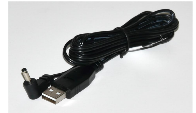
PN 10734 Cable Assy 1.35mm ID x 3.5mm OD RA plug to USB A 6 foot