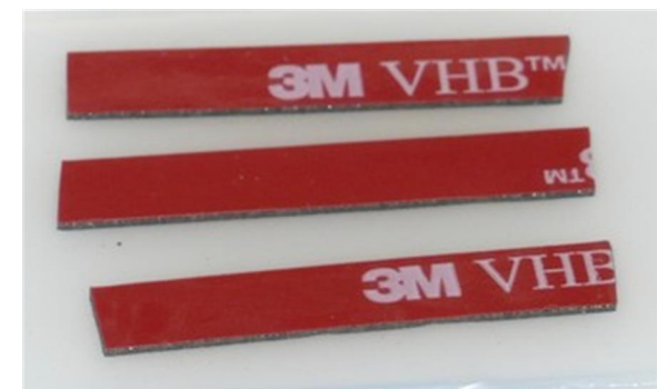
Tape to secure wires.

Power supplies subject to substitution without notice due to availability issues and changes in regulations.