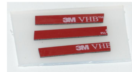
Tape to secure pot cable