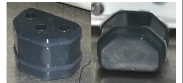
PN 10736 Rubber plug to block unused AC power receptacle.

Power supplies are subject to substitution without notice due to availability issues and changes in regulations.