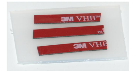
Tape to secure wires.