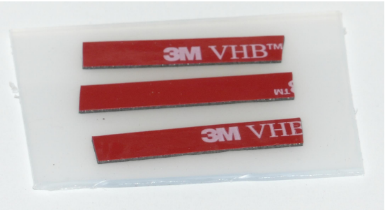
Tape to secure wires.

Power supplies are subject to substitution without notice due to availability issues and changes in regulations.