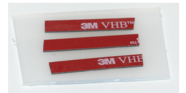
Tape to secure wires.

The illuminator may be powered by plugging the cable into the power supply provided, or into a suitable USB port on a computer or other device.