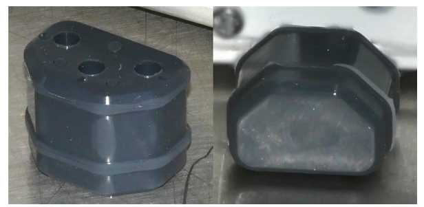
PN 10736 Rubber plug to block unused AC power receptacle.