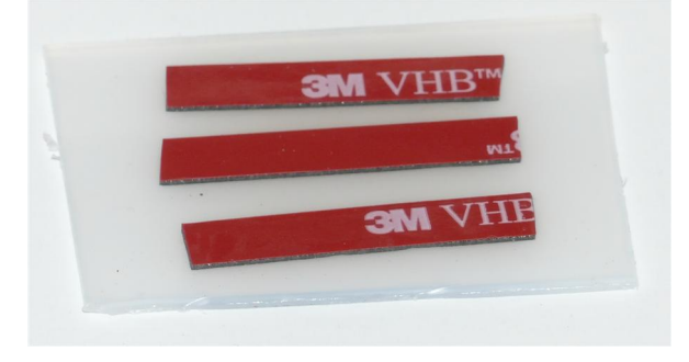
Tape to secure wires.