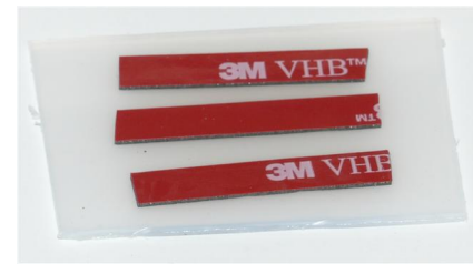
Tape to secure wires.

PN 11170 Pot-Cable Assy - short shaft with tab (30 in cable)