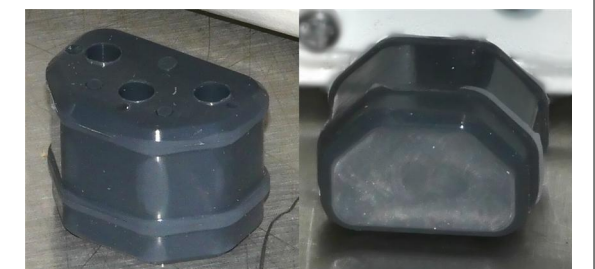
PN 10736 Rubber plug to block unused AC power receptacle.

Power supplies are subject to substitution without notice due to availability issues and changes in regulations.