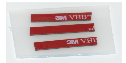
Tape to secure wires.

The illuminator may be powered by plugging the cable into the power supply provided, or into a suitable USB port on a computer or other device.