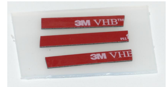
Tape to secure wires.

Power supplies are subject to substitution without notice due to availability issues and changes in regulations.