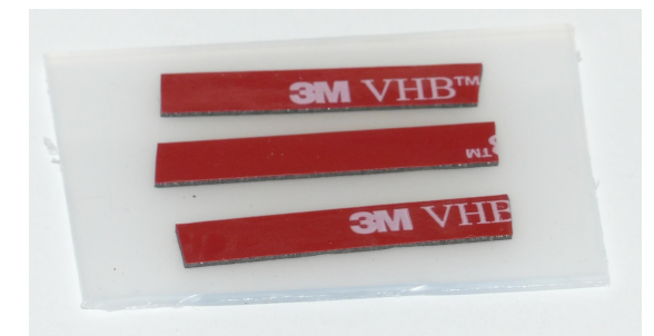
Tape to secure wires.

Power supplies are subject to substitution without notice due to availability issues and changes in regulations.