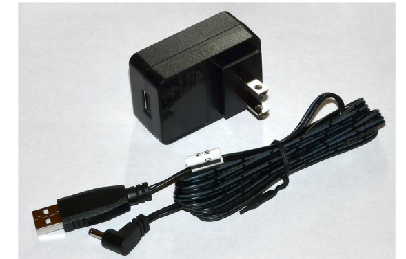
PN 11163 Power Supply 5V 2.1A and PN 10734 Power Cable 1.35mm ID/3.5mm OD x USB A 6 ft.

The illuminator may be powered by plugging the cable into the power supply provided, or into a suitable USB port on a computer or other device.