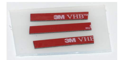
3M VHB tape to secure pot cable