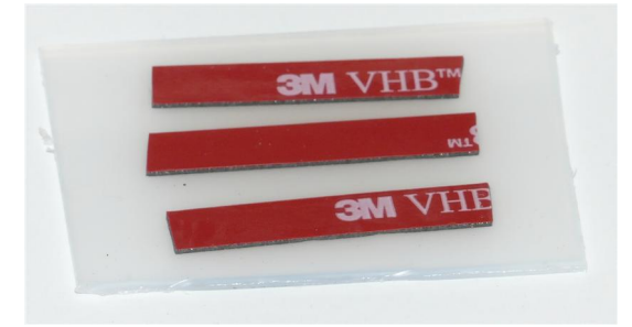
Tape to secure wires.