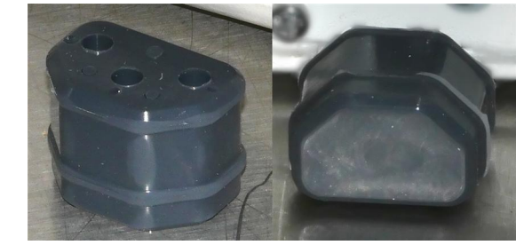
PN 10736 Rubber plug to block unused AC power receptacle.