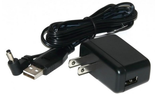
PN 10733 Power Supply and PN 10734 Cable Assy 1.35mm ID x 3.5mm OD RA plug to USB A 6 foot

The illuminator may be powered by plugging the cable into the power supply provided, or into a suitable USB port on a computer or other device.