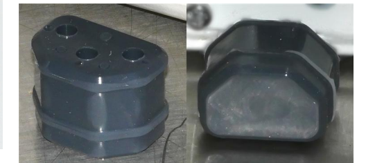
PN 10736 Rubber plug to block unused AC power receptacle.

Power supplies subject to substitution without notice due to availability issues and changes in regulations.