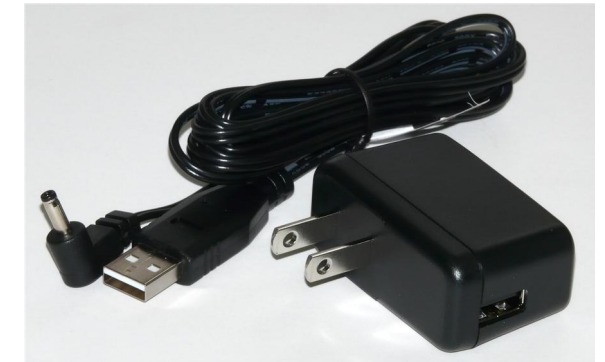
PN 10733 Power Supply - XP Power 5V 1A and PN 10734 Cable 6 foot USB A to 1.35mm ID/3.5mm OD RA Barrel Plug.

PN 10456 Hex Key 1.5mm (for set screws in OEM collector lens tube)