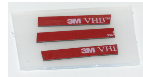
Tape to secure wires.