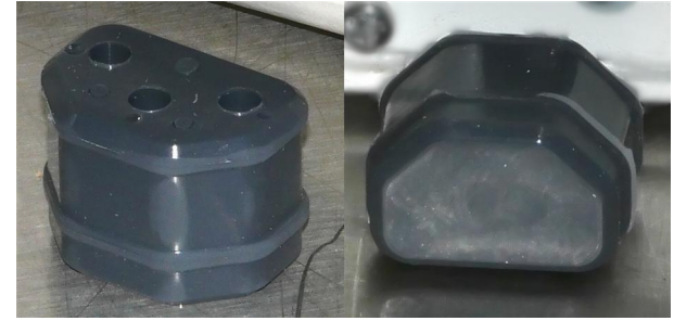
PN 10736 Rubber plug to block unused AC power receptacle.

Power supplies are subject to substitution without notice due to availability issues and changes in regulations.