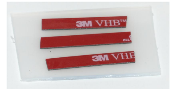
3M VHB tape to secure pot cable