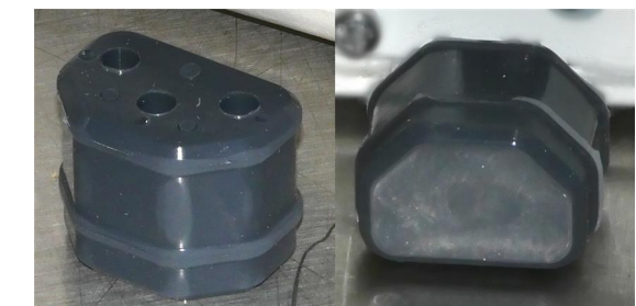
PN 10736 Rubber plug to block unused AC power receptacle.

Power supplies are subject to substitution without notice due to availability issues and changes in regulations.