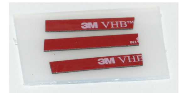
Tape to secure wires.