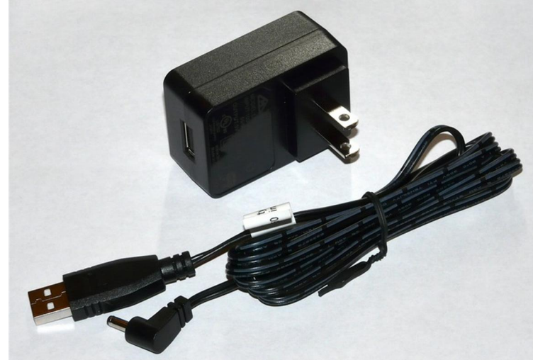
PN 11163 Power Supply 5V 2.1A and PN 10734 Power Cable 1.35mm ID/3.5mm OD x USB A 6 ft.

The illuminator may be powered by plugging the cable into the power supply provided, or into a suitable USB port on a computer or other device.