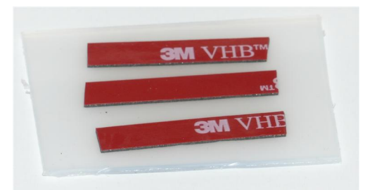
Tape to secure wires.

The illuminator may be powered by plugging the cable into the power supply provided, or into a suitable USB port on a computer or other device.