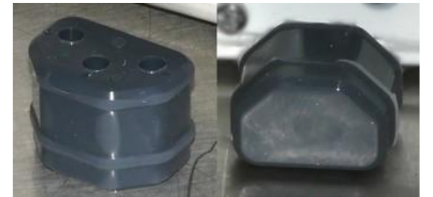
PN 10736 Rubber plug to block unused AC power receptacle.