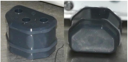
PN 10736 Rubber plug to block unused AC power receptacle.

The illuminator may be powered by plugging the cable into the power supply provided, or into a suitable USB port on a computer or other device.