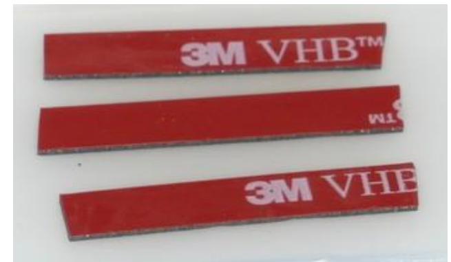
3M VHB Tape to secure wires.