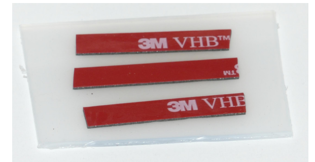
Tape to secure wires.

Power supplies are subject to substitution without notice due to availability issues and changes in regulations.