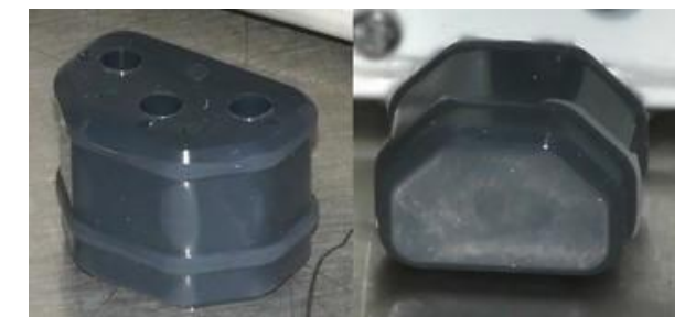
PN 10736 Rubber plug to block unused AC power receptacle.