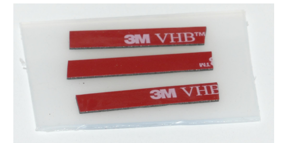
3M VHB Tape to secure wires.

Power supplies are subject to substitution without notice due to availability issues and changes in regulations.